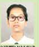
ANSHITAJAJMAYAR 485 (97%)