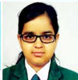
DEWANSHEE 478 / 95.6%