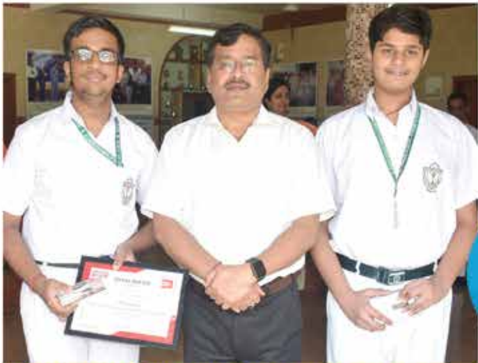
DIPSITES WON THE FIRST RUNNER UP POSITION IN THE HDFC ERGO INSURANCE AWARENESS AWARD JUNIOR (QUIZ 2019) ZONAL ROUND AT KOLKATA