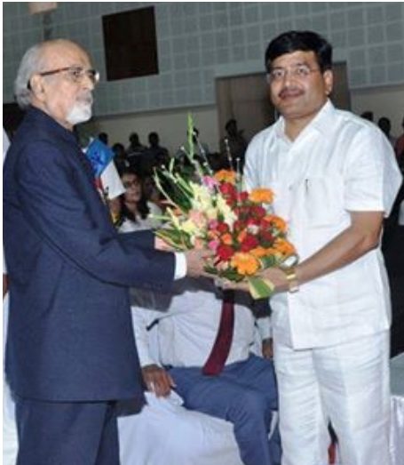
Hon'ble Governor of Jharkhand Late Syed Ahmed recognizing the pioneering feats.