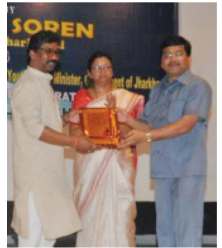
Motivated by Hon'ble Chief Minister Shri Hemant Soren for bringing Laurels to the State.