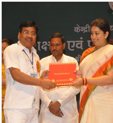
National CBSE Teachers Award 2015 awarded by Smt. Smriti Irani, Hon HRD Minister