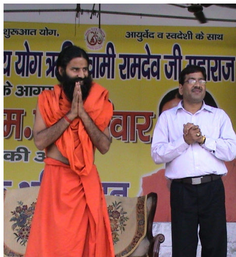
Ingraining value of Yoga in every day life with Baba Ram Dev