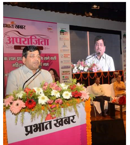
A part of the Program 'Aparajita' wherein Prabhat Khabar honoured women for their commendable work.