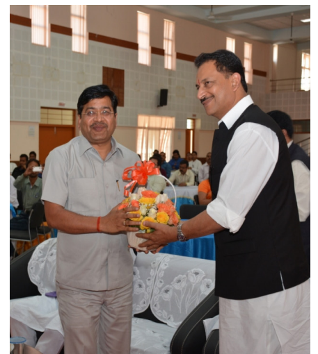
Standing tall with Union Minister Sri Rajiv Pratap Rudy to train and spread awareness about skill development.