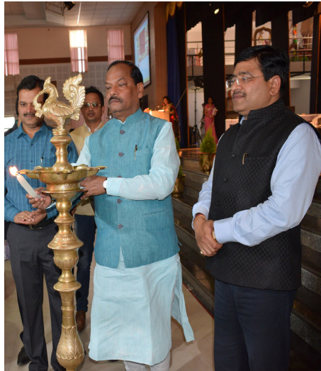
Joining hands to empower the Girl Child.