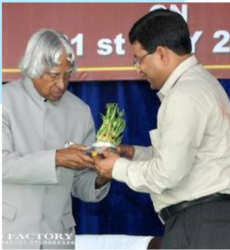
An inspiration for the Young Generation to carry forward the motto SERVICE BEFORE SELF.