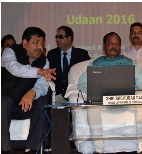
Discussing Strategy with Hon. Chief Minister of Jharkhand Shri Raghubar Das related to UDAAN - A mission to promote Computer Literacy