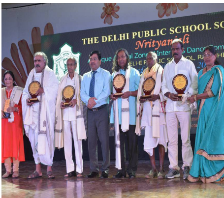
Honouring the Padma Shree Awardees