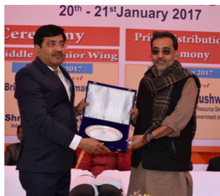
With Shri Upendra Kushwaha, Hon'ble Minister of State for Human Resource Development, Govt. of India