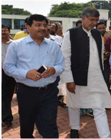
Crusading with Noble Laureate Sri Kailash Satyarthi to root out the menace of child abuse.