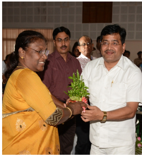
Hon'ble Governor of Jharkhand Smt. Draupadi Murmu Inaugurating DEEPTABH to strengthen under privileged children.